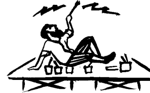
painting the Sistine Chapel ceiling

Welcome to worship! Today is a festival—Reformation Day. What do you notice about your worship space?